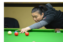
WOMEN'S AND JUNIORS' CHAMPIONSHIPS